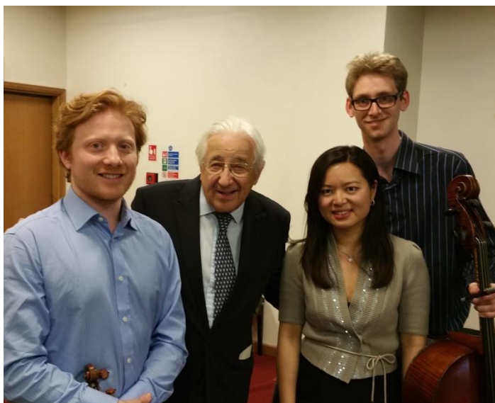
Professor Peter Frankl with the Minerva Piano Trio

Peter Frankl, our own President, was the coach, and his musical insight and experience were clearly of great benefit to the young players. As was to be expected, all three duos presented the first movement of their respective sonatas, with only one of the three going on to the later movements. This is of course normal and understandable. But it also is perhaps regrettable. For slow movements – and third (and fourth) movements – raise interpretive issues of their own, are not always well played, and would certainly be played better with expert coaching.