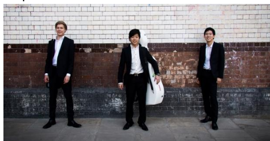
Louko Piano Trio